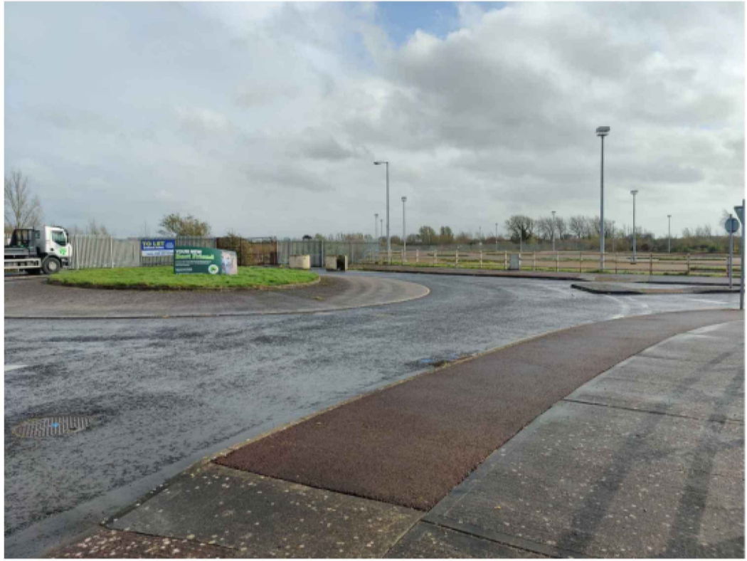
EXISTING LIGHTING COLUMN @ ROUNDABOUT